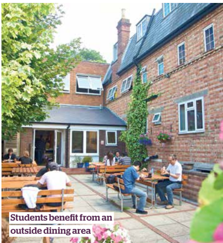
Students benefit from an outside dining area

Kings Oxford consists of two fantastic campuses – St. Michaels in the city centre, and St. Josephs in the popular area of Cowley. Just 20 minutes by bus from the city centre and newly refurbished, St. Josephs provides a large, self-contained college environment that includes a large cafeteria and dedicated art studio. It is where the majority of academic programmes are taught.