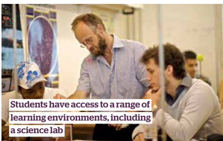
Students have access to a range of learning environments, including a science lab