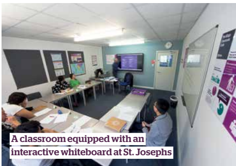
A classroom equipped with an interactive whiteboard at St. Josephs