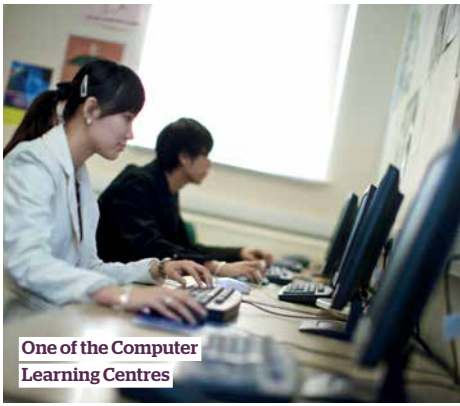
One of the Computer Learning Centres