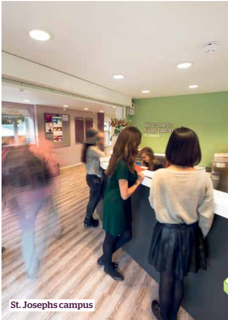
St. Josephs campus