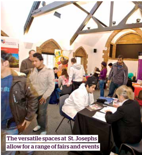
The versatile spaces at St. Josephs allow for a range of fairs and events