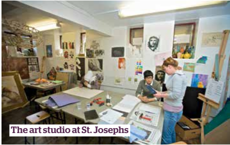
The art studio at St. Josephs